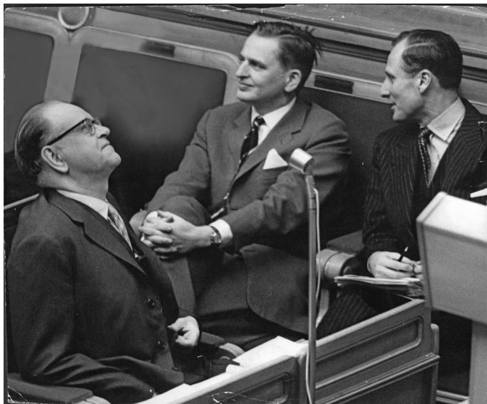
FIGURE 4.4 Swedish Prime Minister Tage Erlander (left), future Prime Minister Olof Palme (middle), and ambassador Sverker Åström (right), Sweden's permanent representative at the United Nations, in 1965. A political insider and major figure in shaping Swedish foreign policy during the post-war decades, Åström devised and implemented the diplomatic strategy that ensured the successful outcome of the Swedish initiative for an environmental conference under UN auspices.

The diplomatic strategy that was to unfold over the next twelve months was devised by Sweden's UN ambassador Sverker Åström (Figure 4.4), one of the most influential diplomats and shapers of