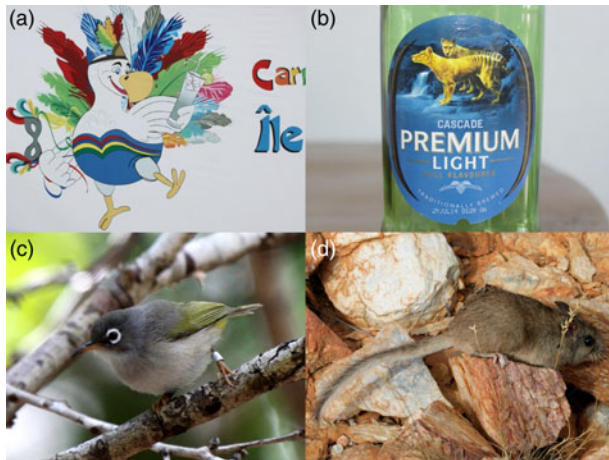
PLATE 1 Images of (a) the dodo Raphus cucullatus and (b) the thylacine Thylacinus cynocephalus used in commercial advertising; (c) the Mauritius olive white-eye Zosterops chloronothus and (d) the central rock-rat Zyzomys pedunculatus , both of which are Critically Endangered. (c) and (d) are poorly known and have less marketability as flagship species, but can be directly linked to (a) and (b), respectively, which have high conservation marketability.