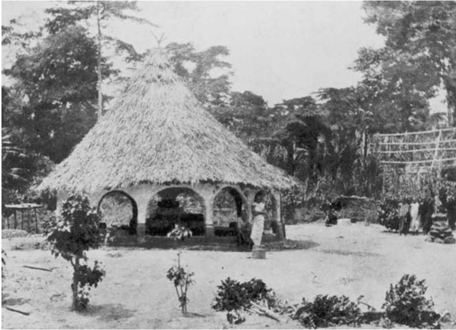
Fig. 2. Arthur Ffoulkes's original caption for this photograph reads: 'A good specimen of a Borgya shrine, showing the erection for skulls, on left and right, with the stone cairn, and part of the circular hedge cut down in the foreground. Tano-Dumase in Ashanti'. From Journal of the African Society , 8 (1908–9), facing 388.

manifestations of the twin deities varied. They most commonly took the form of balls of compressed organic matter, decorated with cowries in the case of Manguro/Burogya and invariably described as black in the case of Aberewa. In some locations they were represented by a pair of anthropomorphic figures fashioned from wood or clay. At one shrine in the western Gold Coast investigated by Ffoulkes, the suman was even embodied by a living tortoise ('which I at once rescued and have kept alive as a trophy'). 62 According to information compiled by agents of the Basel Mission, once messengers had been sent to Takyiman or direct to Bonduku requesting Aberewa, the 'high priest' Osei Kwaku himself or one of his deputies would convey the sacred objects and associated ritual paraphernalia in pomp from the northwest.