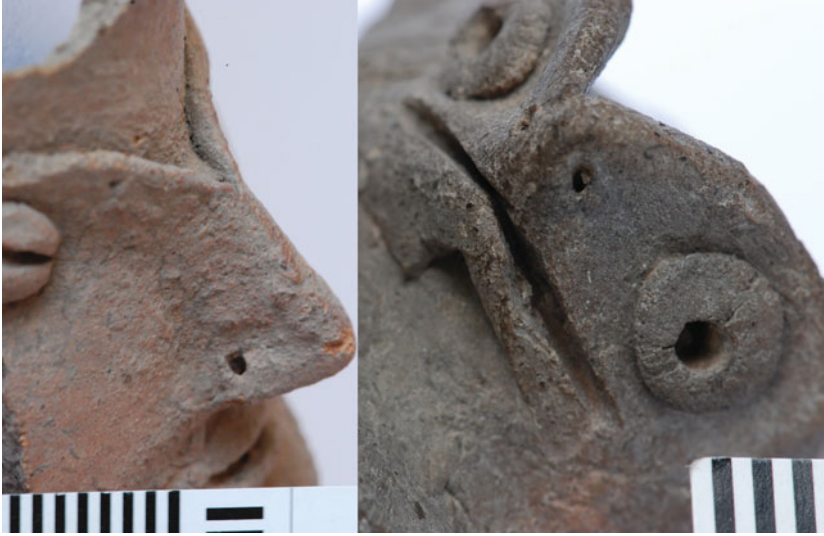
Figure 3 Detail of La Candelaria ceramic from the Museo Arqueológico El Cadillal. Photograph by the author (Colour online).

philosophy’. In other words, shamans use the props to avoid having to make lengthy explanations to the uninitiated.