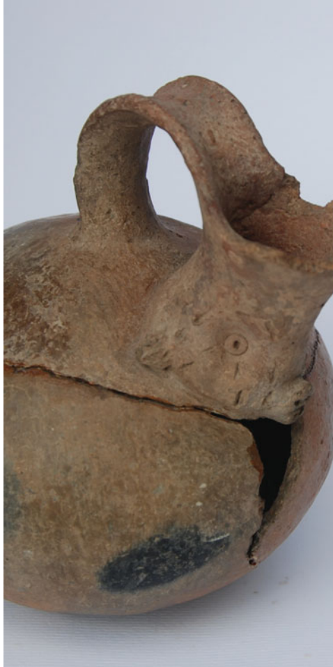
Figure 2. Detail of La Candelaria ceramic from the Museo Arqueológico El Cadillal. Photograph by the author (Colour online).

which apprehend reality from distinct points of view'. Bodies are the seats of these distinct perspectives. Among the La Candelaria ceramics, zoo- and anthropomorphic bodies are fixed onto other bodies.