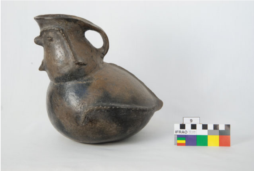
Figure 1. La Candelaria ceramic pot from the Arminio Weiss Collection, Museo Municipal de San Rafael, Argentina. Photograph by the author (Colour online).

masonry made uncanny by the absence of the people and things that they allude to by their very presence. Alterity I take to mean a state of being that escapes conventional modes of understanding. Can anything be made of it, or is it beyond the pale of archaeological analysis? My hope is that we can make something of it. I advocate for archaeologies of ‘risk’ and ‘wonder’. Through theoretical risk-taking and taking a stance of wonder in the face of our materials we open ourselves to the alterity latent in things and our experience of them.