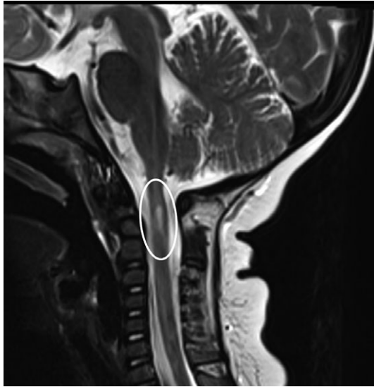
Figure 2: MRI demonstrated the presence of myelopathy at the level of the dystopic os odontoideum (circle).

population, 7,10 but the literature lacks reports about very young children with significant manifestations. In our case, the considerable improvement after surgical fixation suggests that the os odontoideum determined an atlaxial instability and caused symptoms.