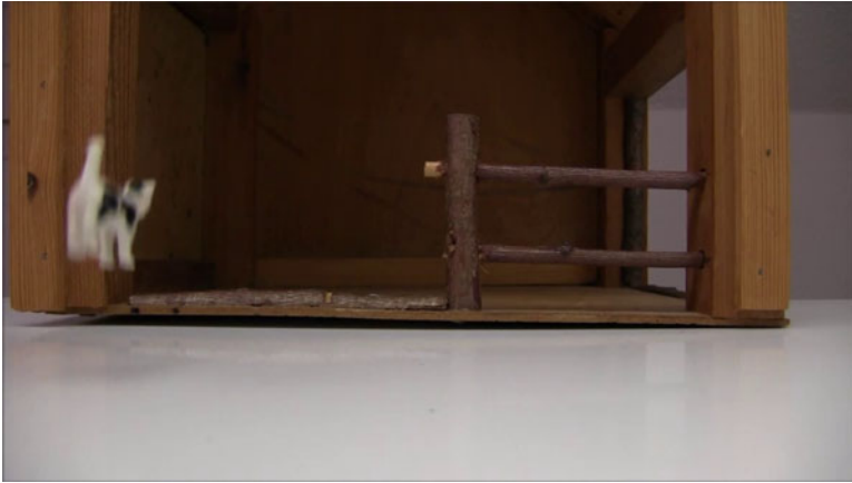
Figure 1. Screenshot of the video in which a cat appears while jumping in the direction of the farm