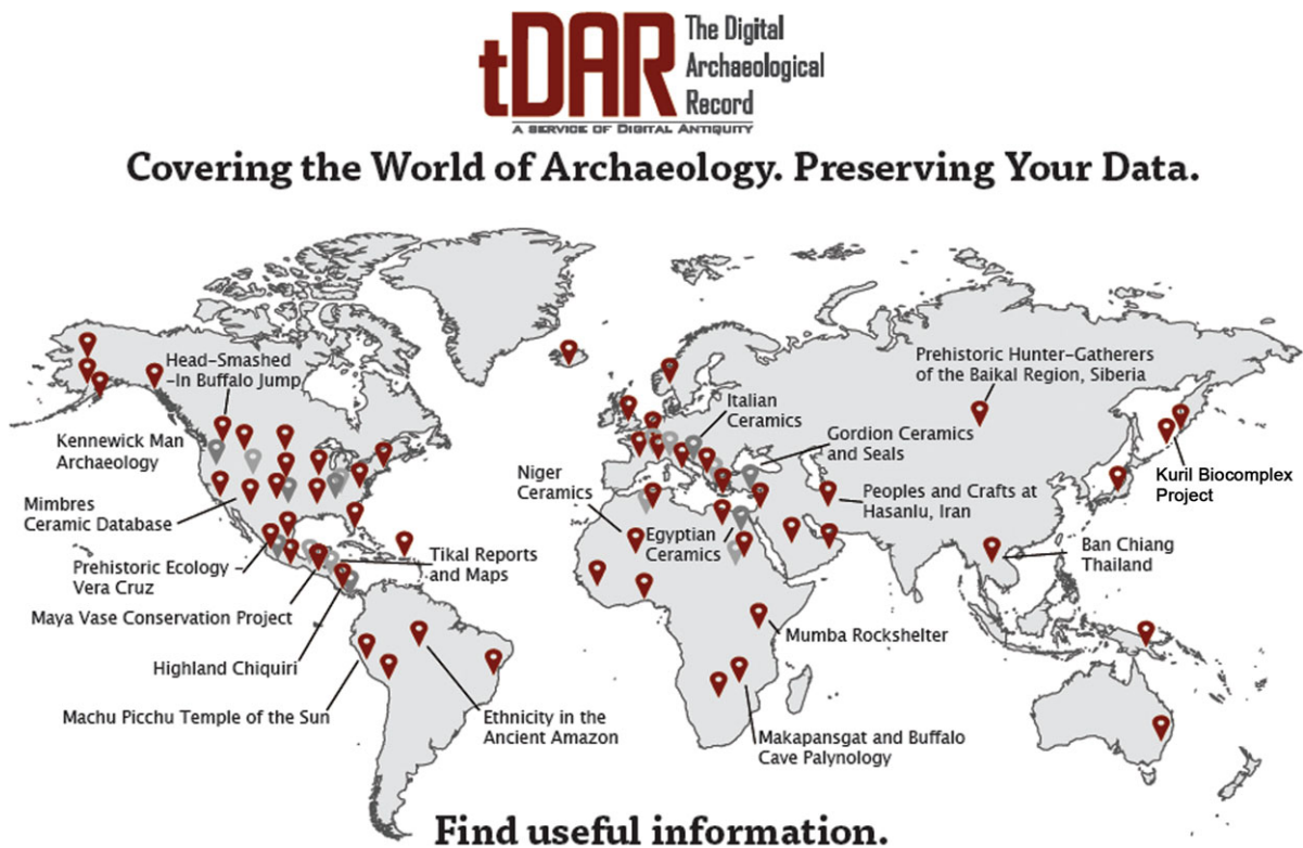
FIGURE 3. Schematic view of global contents of tDAR showing some examples.

worked with the Maryland Archaeological Conservation Laboratory and Fort Lee Regional Repository to establish an archive in tDAR for digital files from 17 military facilities for which these two repositories curate physical collections and associated paper records (Cofield and Eyre 2014; Department of Defense Legacy Program 2014).