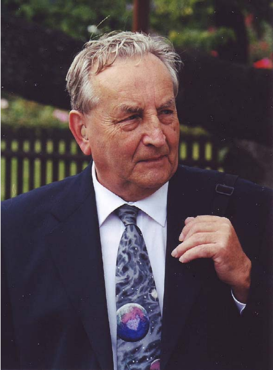
Figure 5.