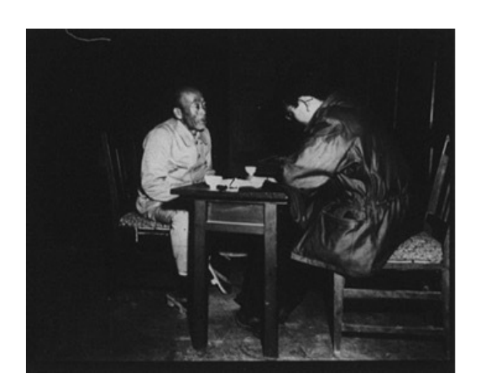
Image 2: USSBS interview with Japanese citizen. United States Strategic Bombing Survey Morale Division, National Archives at College Park, Maryland, Microfilm Locator M1655, Roll 138.

In the fall of 1945, the United States Strategic Bombing Survey (USSBS) surveyed several thousand evacuees in 57 cities. The first-hand accounts of evacuees detail the complicated reality of the wartime civilian experience, one shaped by ever-changing civil defense policies, air raids and their aftermath, and government efforts to shape refugees' perceptions of the war through its policies and propaganda. The accounts reveal that a range of concerns permeated their lives during the war: anxieties over the impact of air raids; the logistics of evacuating; negative social situations in the rural areas to which they evacuated; and a lack of food, shelter, clothing, and medical supplies.<sup>5</sup>