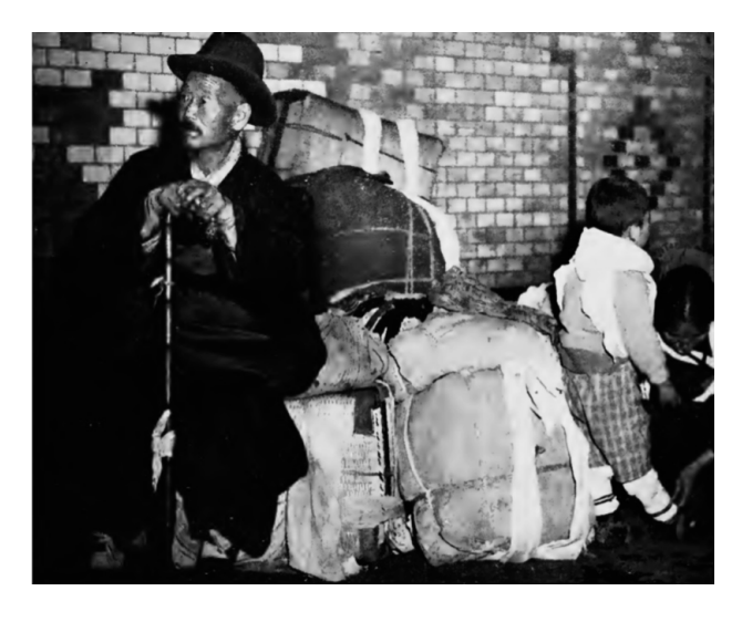
Image 1: Wartime evacuees.

Keywords: Evacuation, evacuees, World War II, firebombing, civilians, United States Strategic Bombing Survey (USSBS), social unrest, home front.