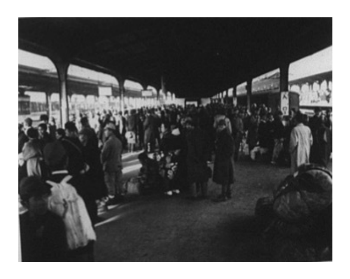
Image 3: Tokyo station immediately after the war. United States Strategic Bombing Survey Morale Division, National Archives at College Park, Maryland, Microfilm Locator M1655, Roll 138.

"The government paid our train fare and took care of our baggage. They made no arrangement for our living here."<sup>23</sup>