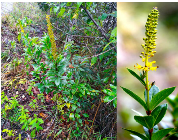
Abatia microphylla , habit and inflorescence detail.

The flora of Pedra do Imperador is threatened by anthropogenic impacts, including invasive species ( Pteridium arachnoideum (Kaulf.) Maxon), horse farms, livestock,