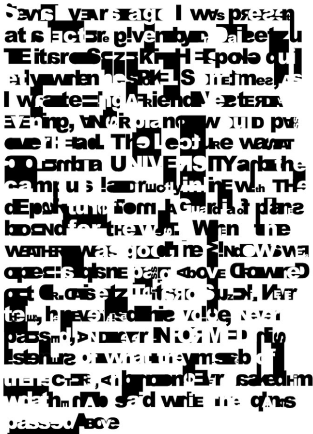
Sometimes, people ask me what it's like to be Dyslexic.

Homer Rutledge created the image shown in Figure 3 as an exercise for non-dyslexic people to “better understand the difficulties and frustrations a dyslexic person faces even when trying to read something as simple as a poem.” 72 While the image is not a literal representation of dyslexia, what it generates in the