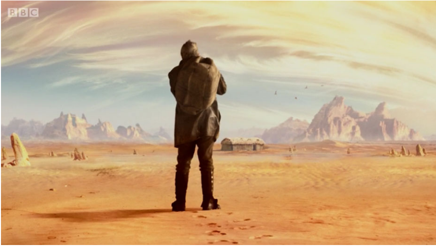
Figure 4. The war doctor carrying a sack. A still from Steven M. Doctor Who: The Day of the Doctor . Film, London: BBC; 2013.

the proposition ‘the cat in the box is alive’ is true if and only if the objects and relations in the proposition properly map those in reality—that is, there exists a box with a cat in it, and the cat is alive. 80 Wittgenstein ultimately dropped his picture theory of language, but the ‘picture’ framework is useful to the picture theory of disability both as a means of metaphysically tying the experience of the activity to the activity itself and in delineating the elements or objects relevant to the experience of disability.