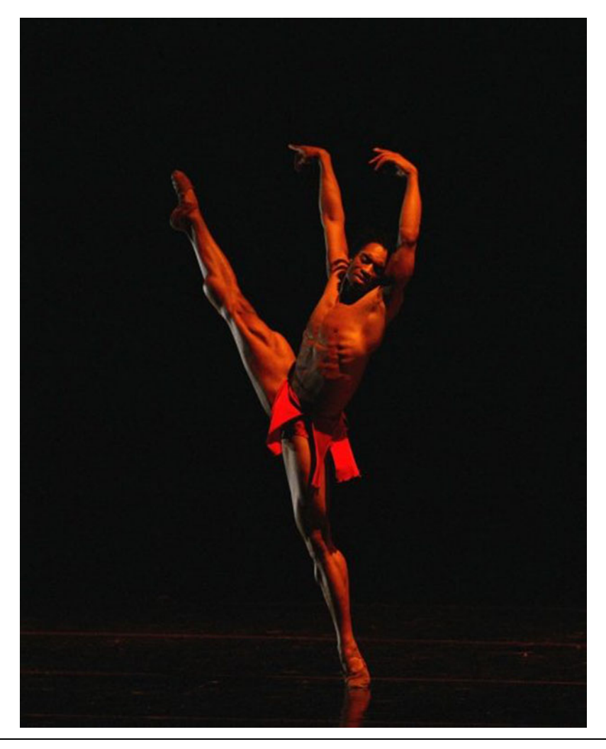
Photo 4. Desmond Richardson in Dwight Rhoden's Solo. Complexions Contemporary Ballet.

is grappling with himself and acceptance of who and what he is" (Mendoza 2009). Mirroring the paradoxical nature of the concept of the virtuoso, here one of the least anonymous performers executes an abstract tale of anonymity. Emotional vulnerability is translated through a choreographic palette executed with tremendous skill. Moreover, Solo presents the tension between the identity of the performer and the content of the performance, which recalls the prevalent observation that virtuosity makes it difficult to distinguish between performer and performance. To stage Richardson in a solo is to stage the question of virtuosity itself—a concept most at home in the context of solo performance.