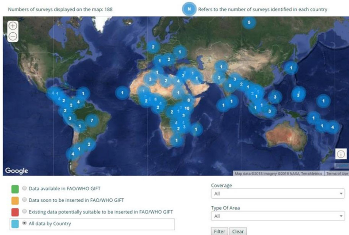
Fig. 2. (Colour online) Results of the FAO/WHO Global Individual Food consumption data Tool (GIFT) inventory of existing individual quantitative food consumption data and planned surveys presented on an interactive map in the web-dissemination platform. (Source: Snapshot from the FAO/WHO GIFT platform).

through a metadata report providing a comprehensive and standardised description of the survey (e.g. title, objective of the data collection, methods used to design the survey, to collect data, to estimate portion sizes, etc.).