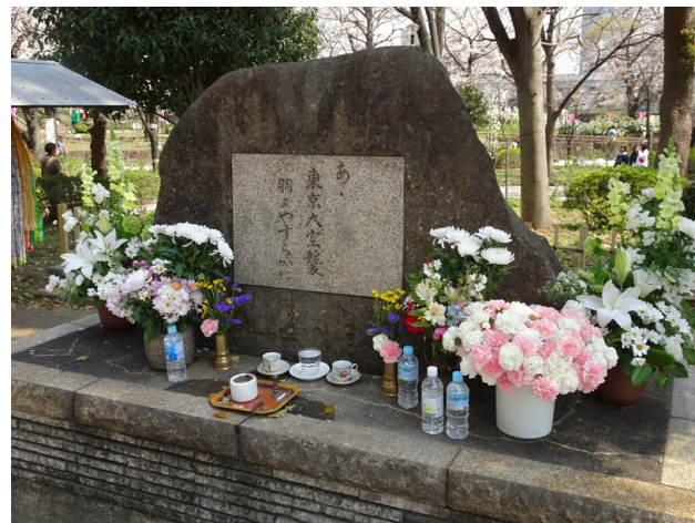
A monument for victims of the Tokyo firebombing near Kototoi Bridge, where many people died.