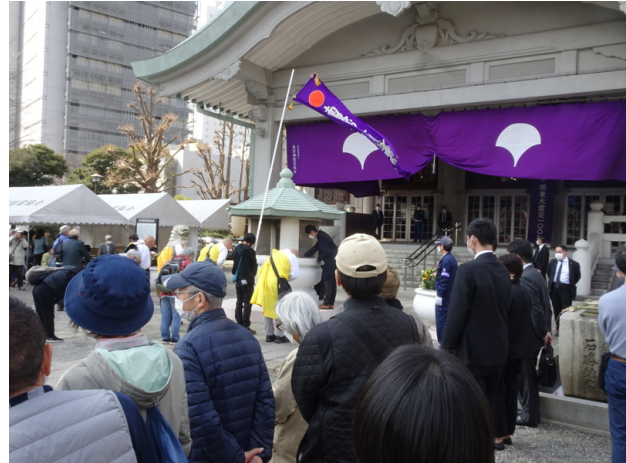
People gather outside the Tokyo Memorial Hall before a memorial service on the 78th anniversary of the Tokyo firebombing on March 10, 2023.

In their mid-eighties or early nineties at the time of filming, the central concern of the survivors was that awareness of the catastrophe and its significance may be lost for future generations if the Japanese government continues to resist honoring the victims and inscribing the event in public memory, as it has done since the early postwar years. The efforts of these three individuals, along with others, are epitomized in the film's epigraph from Milan Kundera, "The struggle of man against power is the struggle of memory against forgetting."