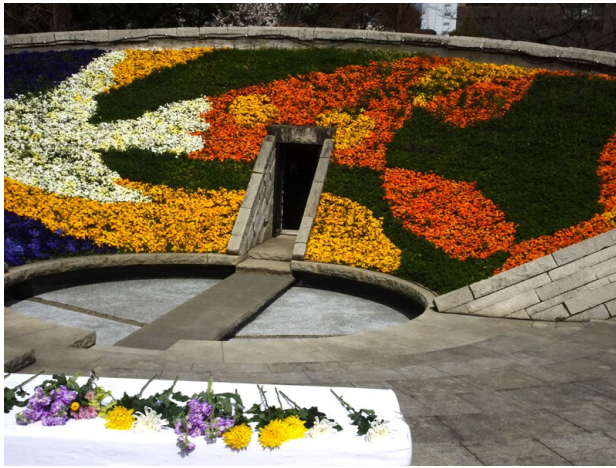
The modest public monument in Yokoamicho Park for the victims of the Tokyo firebombing on the 78th anniversary on March 10, 2023.

succeeded in nullifying plans for the museum in 1999.