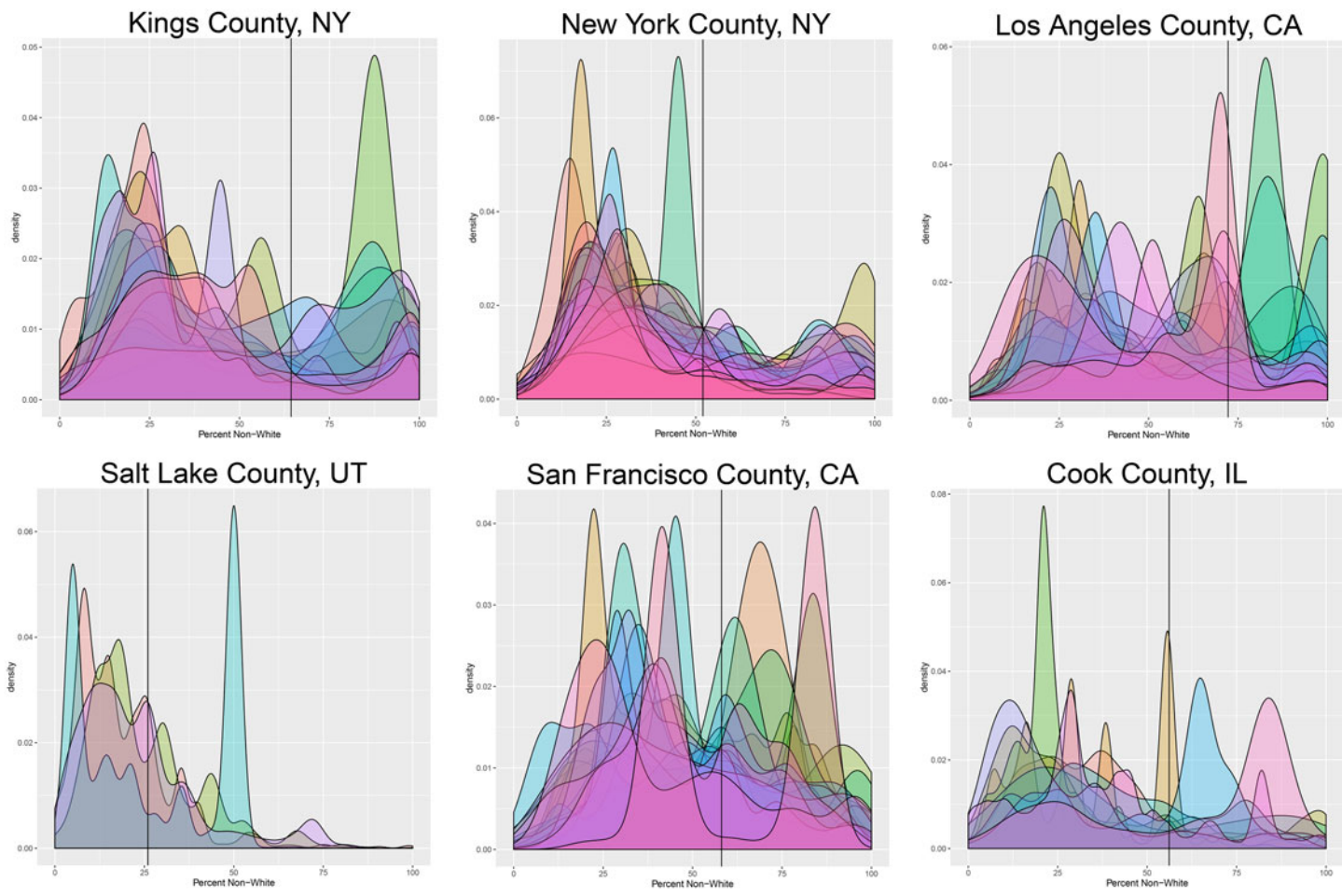
Figure 5. Examples of racial experiences in select metropolitan counties. Individuals living in the same county have disparate racial experiences. Panels show the distribution of the racial and ethnic composition of the census blocks that individuals travel through, grouped by modal county. The x-axis is the percent non-white; densities farther to the right indicate more diverse (less white) racial and ethnic contexts. Vertical lines represent the percent of the county population that is non-white.