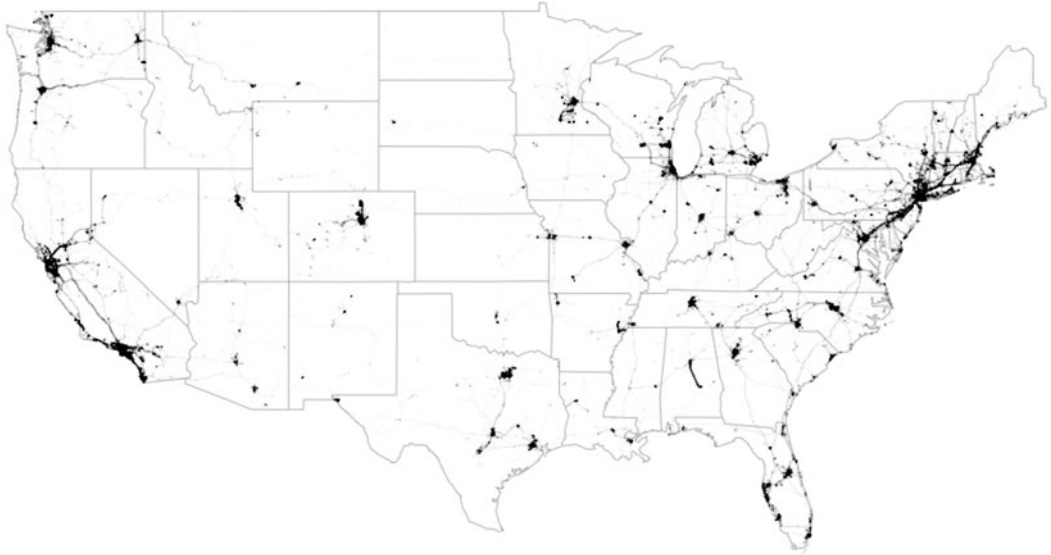
Figure 2. The OpenPaths sample. The roughly 2.6 million GPS coordinates for all individuals in our OpenPaths sample. Every state is represented; coordinates are concentrated in the Northeast and West Coast. Darker shading represents areas with more observations.

Our sample of OpenPaths users includes 2.6 million data points from 446 individuals. Figure 2 displays all of these points. The number of GPS points for each individual range from 1 to over 111,000 with the median number of coordinate pairs being about 3200. On average, we have about a year's worth of geolocation for the individuals (364.4 days) with a maximum of over 4 years' worth of data. For just over 1 percent of our respondents, we have less than a day's worth of geolocations. We place each geographic coordinate into a 2010 US Census block indicated by a 15-digit Federal Information Processing Standards (FIPS) code, which uniquely identifies the point's census block, census block group, census tract, county, and state. We record coordinates in all fifty states and the District of Columbia. Even sparsely-represented states include a few hundred observed points (North Dakota: 203; Nebraska: 899; and South Dakota: 974), and the more commonly-observed states include hundreds of thousands of points (Pennsylvania: 6 percent of the total, or 174,693; New York: 12 percent or 312,129; and California: 22 percent or 569,175). Online appendix Figure 1 displays the distribution of coordinates by state. Despite the scope of geographic coverage, we again note that we have no way to access covariate data to determine if the sample is demographically nationally representative.