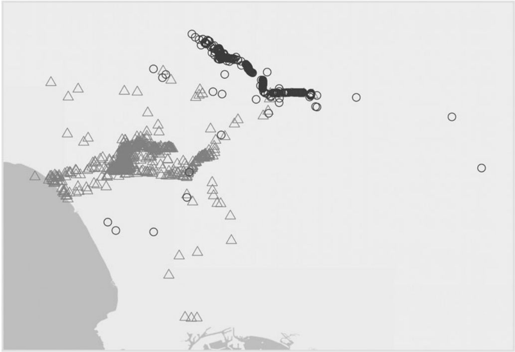
Figure 1. The paths of two individuals in Los Angeles County. Person 1 (△) is concentrated in West Los Angeles and Person 2 (○) in La Crescenta-Montrose.