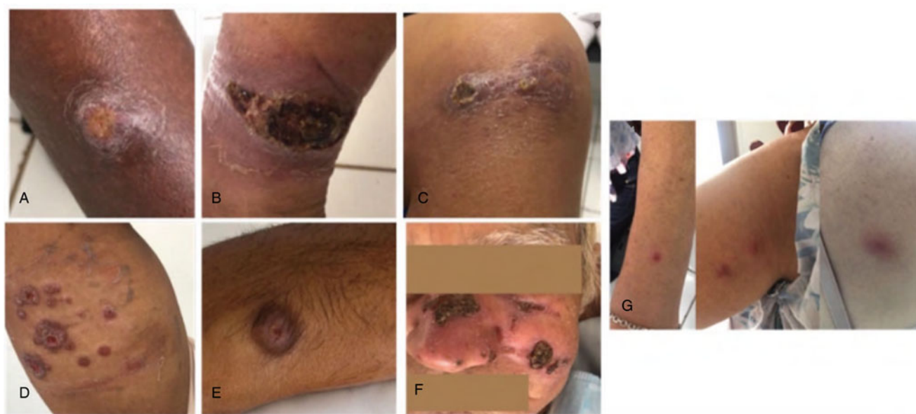
Figure 2. Leishmaniasis lesions. (A) L. braziliensis , localized form on the leg. (B) L. braziliensis , localized form on the posterior part of the leg. (C) L. braziliensis , disseminated form throughout the body. (D) L. braziliensis , disseminated on the arm and forearm. (E) L. braziliensis , localized on the arm. (F) L. braziliensis , mucocutaneous form on the face and nasal mucosa. (G) L. infantum lesions.

The time of evolution of ATL symptoms determines the severity of the disease. Delays in diagnosis and treatment initiation may