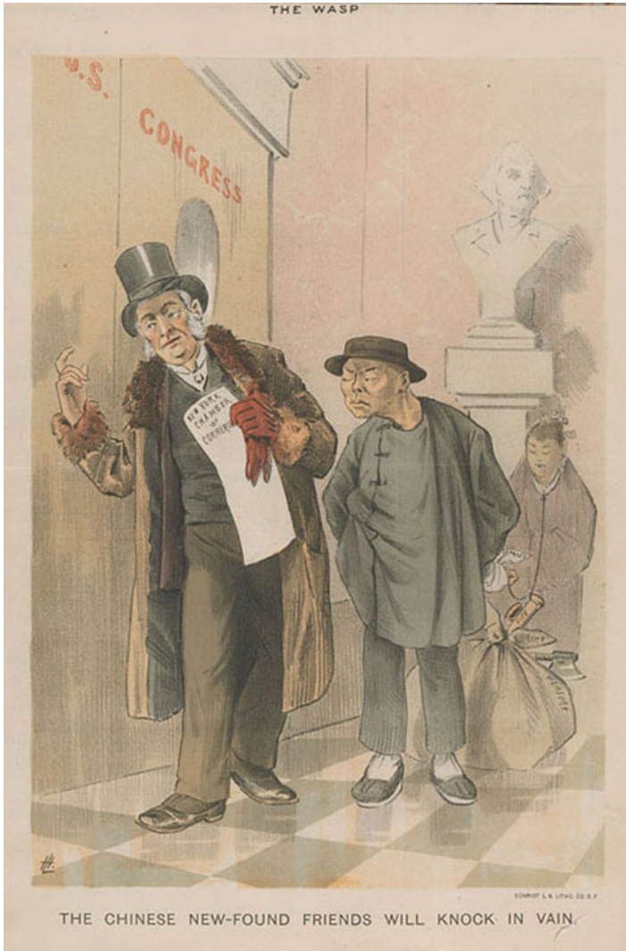
FIGURE 2. This 1889 cartoon from The Wasp criticizes the U.S. corporate efforts—here represented by the New York Chamber of Commerce—to lobby Congress on behalf of the entry of Chinese migrants and the vices they carry with them. The woman standing behind the Chinese man may be his wife—a reference to the permission granted to the spouses of the “exempt” to migrate—or she may (in reference to the “Vices” in the man’s bag) be a symbol of prostitution, consistent with the attribution of “immorality” to Chinese migrant women.

demagogue Dennis Kearney had once rallied San Francisco mobs with the infamous applause line “The Chinese Must Go!,” missionary Esther Baldwin, by contrast, plaintively titled her otherwise sardonic, pro-immigration reply Must the Chinese Go? The exemplary figure here was missionary Luella Miner who, in 1902, lobbied on behalf of two