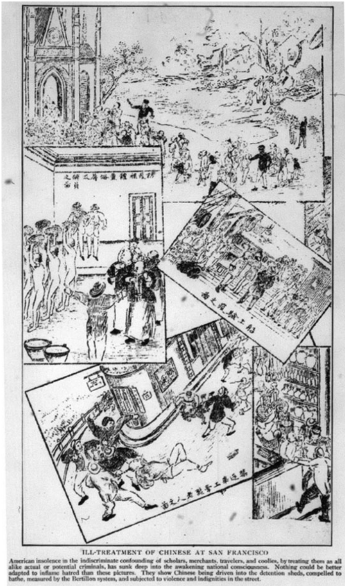
FIGURE 4. This collection of boycott flyers, gathered and reprinted by missionary Arthur H. Smith in 1906, shows Chinese people in the United States being attacked in the streets by American mobs, driven into detention sheds and forced to bathe. The lesson Smith took away from them was that “the indiscriminate confounding of scholars, merchants, travelers, and coolies” had “sunk deep into the awakening national consciousness.” From “A Fool’s Paradise,” Outlook 82:12 (March 24, 1906), pp. 701–6.