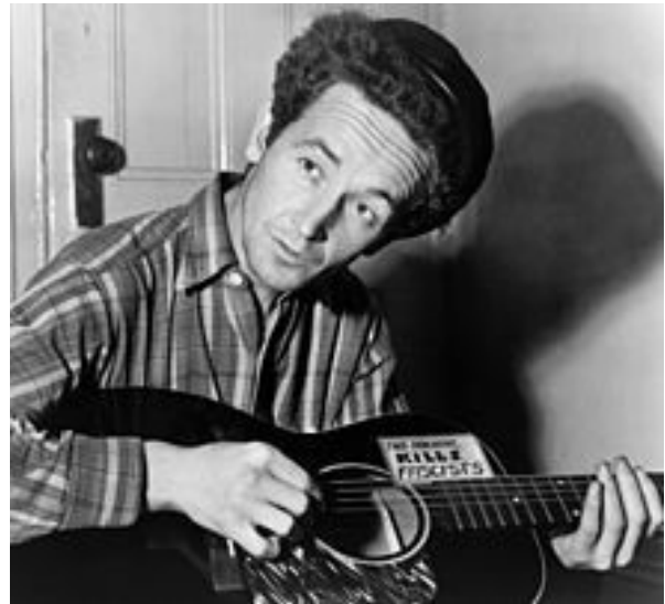
Woody with guitar labeled “this machine kills fascists”, 1943.

Throughout the 1930s, Woody opposed American involvement in World War II, writing and performing numerous antiwar songs that excoriated Franklin Roosevelt as a duplicitous warmonger. His view shifted after 1941 when Hitler broke the 1939 Molotov-Ribbentrop non-aggression pact and replicated Napoleon’s folly by attacking Russia which then joined forces with the Western allies to fight fascism. 2 With the U.S. in the war after Pearl Harbor, Woody began penning songs like “Lindbergh,” which excoriated the isolationists and America First, though another of his songs expressed a secret desire for all the soldiers “on every single side” to “take off [their] helmet, unbuckle [their] kit, lay down [their] rifle ...and say, nope, I ain’t gonna kill nobody.” 3