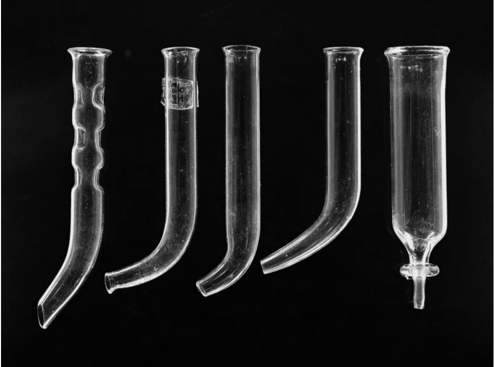
Figure 1 : Leech tubes, curved glass.

of medical commerce without corrupting it thus became an area of keen debate, further blurring boundaries between the natural and artificial.