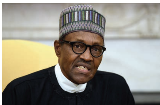
Figure 39 Nigeria's president, Muhammadu Buhari

But, as the West Africa Centre for Democracy and Development notes, far from being frivolous and lazy, young Nigerians have simply lost hope in institutions that do not serve their interests. 7 The majority of Africans, and especially young Africans, think their governments are doing a very bad or a fairly bad job at addressing the needs of