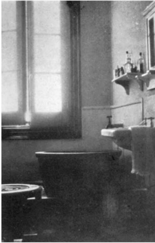
Figure 3. “The Bath Room – Chinese Style”. Kohler of Kohler News, January 1921 , p. 15.

representative of a Shanghai company (see Figure 3 above). The bathroom included an English pottery-ware lavatory that “does not differ materially from many lavatories that might be seen in this country”. But it coexisted with a “much more remarkable” bathtub that was “round and made of clay and [...] of Chinese manufacture”, and in which “apparently it would be necessary to stand while bathing”. The commode, significantly, had no water flushing system. Here hygienic progress and sanitary inefficiency battled in the confines of a single room. 27