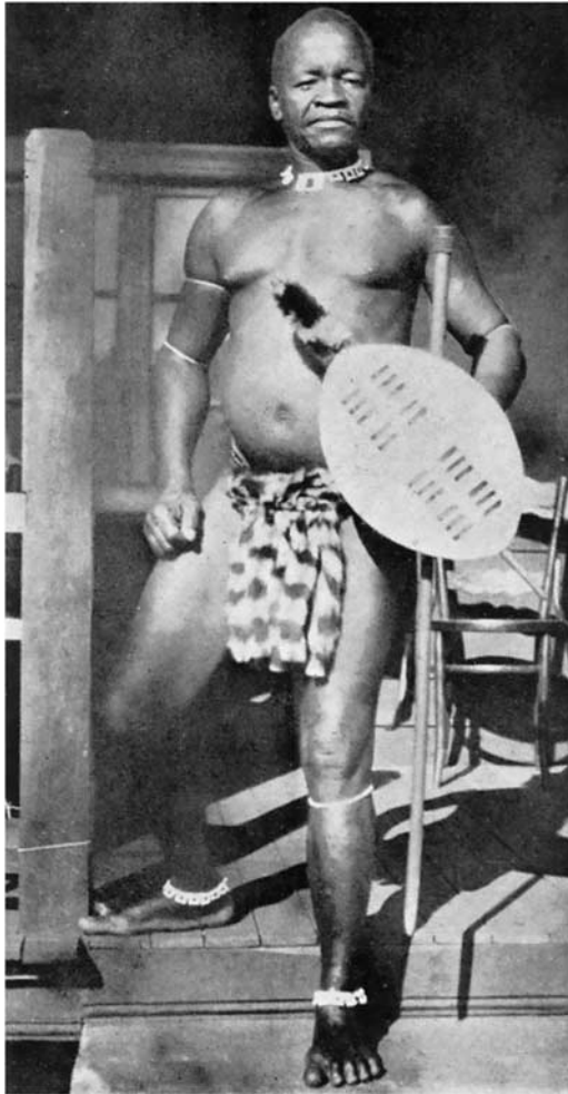
Figure 4. “A Kohler Competitor”. Kohler of Kohler News, July 1924 , p. 10.

As black activists regularly pointed out, however, dwellings deemed hygienically appropriate were usually beyond the means of a population racially denied access to skilled construction trades – or any employment approaching the wages that dictated the prices of dwellings such trades could build. Insult was added to injury when the housing schemes provided for African labor boasted “modern” water-borne sewage only in public latrines. Ironically, African householders whom whites perceived as being among the most “civilized” shunned water-borne sewage offered