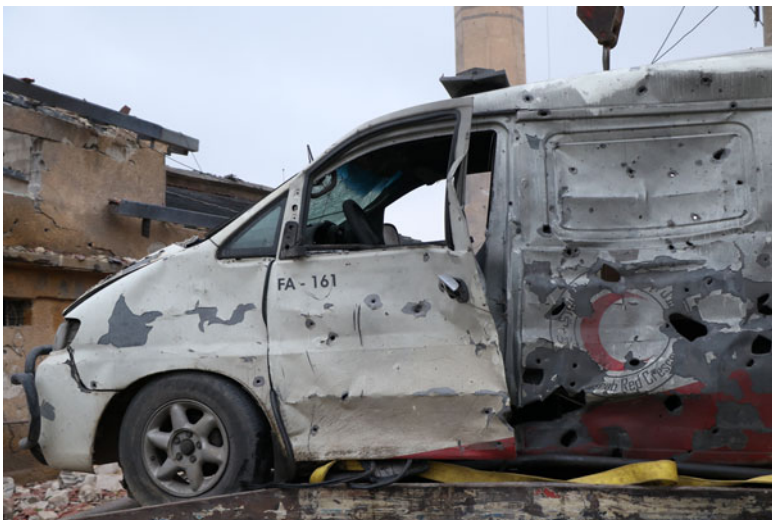
Figure 6. The SARC has tragically lost sixty-five volunteers who have sacrificed their lives in pursuit of their humanitarian mission.

The SARC and ICRC emphasize the protection of their personnel and volunteers. It is a key norm of international humanitarian law that humanitarian volunteers and staff are not a target. Despite this, sixty-five SARC volunteers have sacrificed their lives for the sake of their humanitarian duty. SARC facilities and vehicles have also been badly damaged.