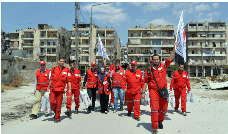
Figure 1. The SARC and the ICRC work together for the people of Syria.