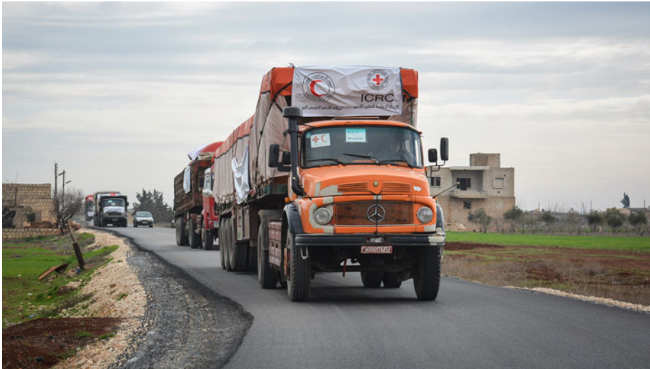
Figure 5. Joint convoy to Aleppo.