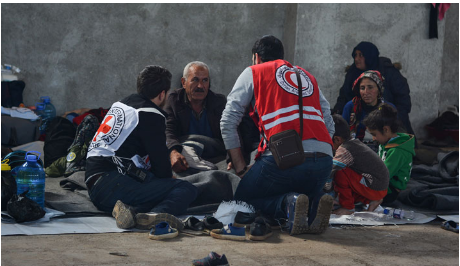
Figure 4. Evacuation of people in need from Aleppo.

Driven by their commitment to the principles of the International Red Cross and Red Crescent Movement, the SARC and ICRC work together to respond to humanitarian needs across Syria, including directly providing medical services, ensuring those in hard-to-reach areas can receive medical assistance, delivery of aid convoys, ensuring internally displaced people (IDPs) have access to food and basic necessities, equipping IDP shelters, and helping to restore family links.