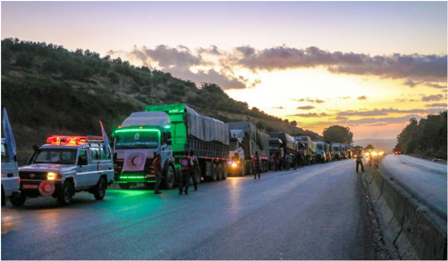
Figure 3. Arrival of a humanitarian convoy at Der Al-Zour.

Driven by their commitment to the principles of the International Red Cross and Red Crescent Movement, the SARC and ICRC work together to respond to humanitarian needs across Syria, including directly providing medical services, ensuring those in hard-to-reach areas can receive medical assistance, delivery of aid convoys, ensuring internally displaced people (IDPs) have access to food and basic necessities, equipping IDP shelters, and helping to restore family links.