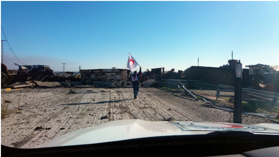
Figure 2. Crossing the front lines to provide humanitarian relief.

The Syrian Arab Red Crescent (SARC) and the International Committee of the Red Cross (ICRC) have stood shoulder to shoulder in partnership to help the most vulnerable and address the needs of millions of people throughout Syria. Particularly since 2011, the two organizations have collaborated to respond to diverse humanitarian needs with the ultimate goal of protecting human dignity.