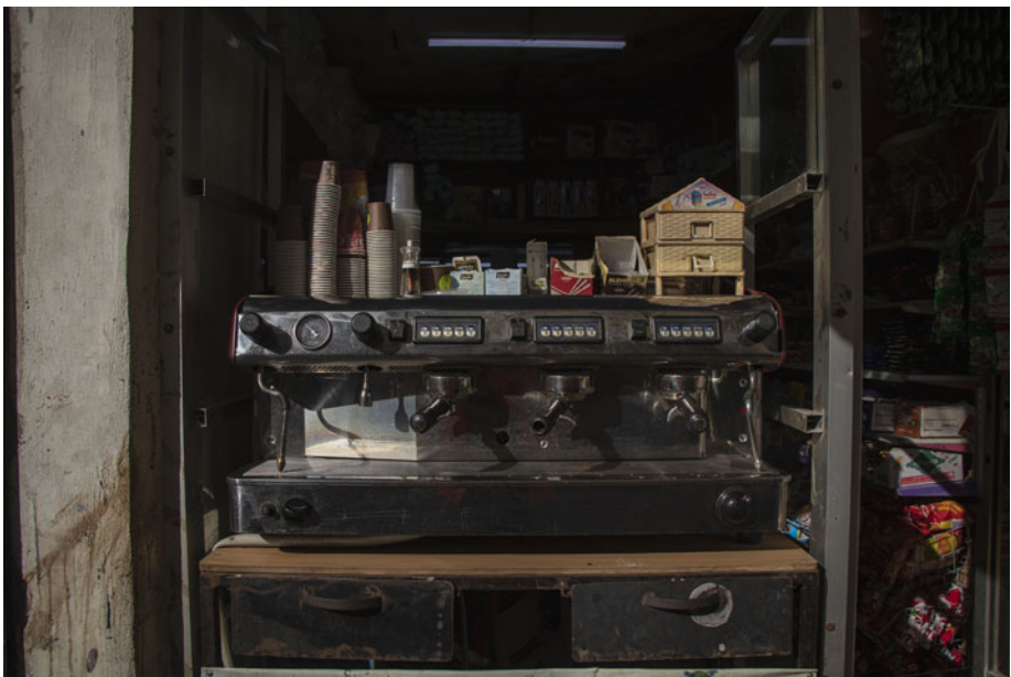
Figure 13. A coffee machine in Hisham's shop.