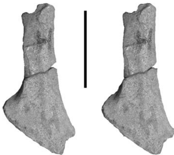
Figure 6. Distal end of a left ischium of an abelisauroid theropod from the Late Jurassic of Tendaguru, Tanzania; MB.R.1756. Lateral view (stereopair). Scale bar is 50 mm.