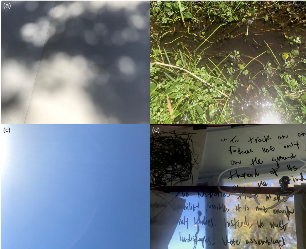
Figure 2. Series of photographs from concept development workshop of ‘Theories of lines, knots and knotting’.

We are drawn to the sense of loss, of grief, of beauty, and of gratitude. Ecological pulses come from and enable new possibilities of the experiences of ancestral power. The pulses of ancestral experience and ancestral aesthetics lure our attention and offer rewards. Our senses are heightened, and we attune to the brilliance.