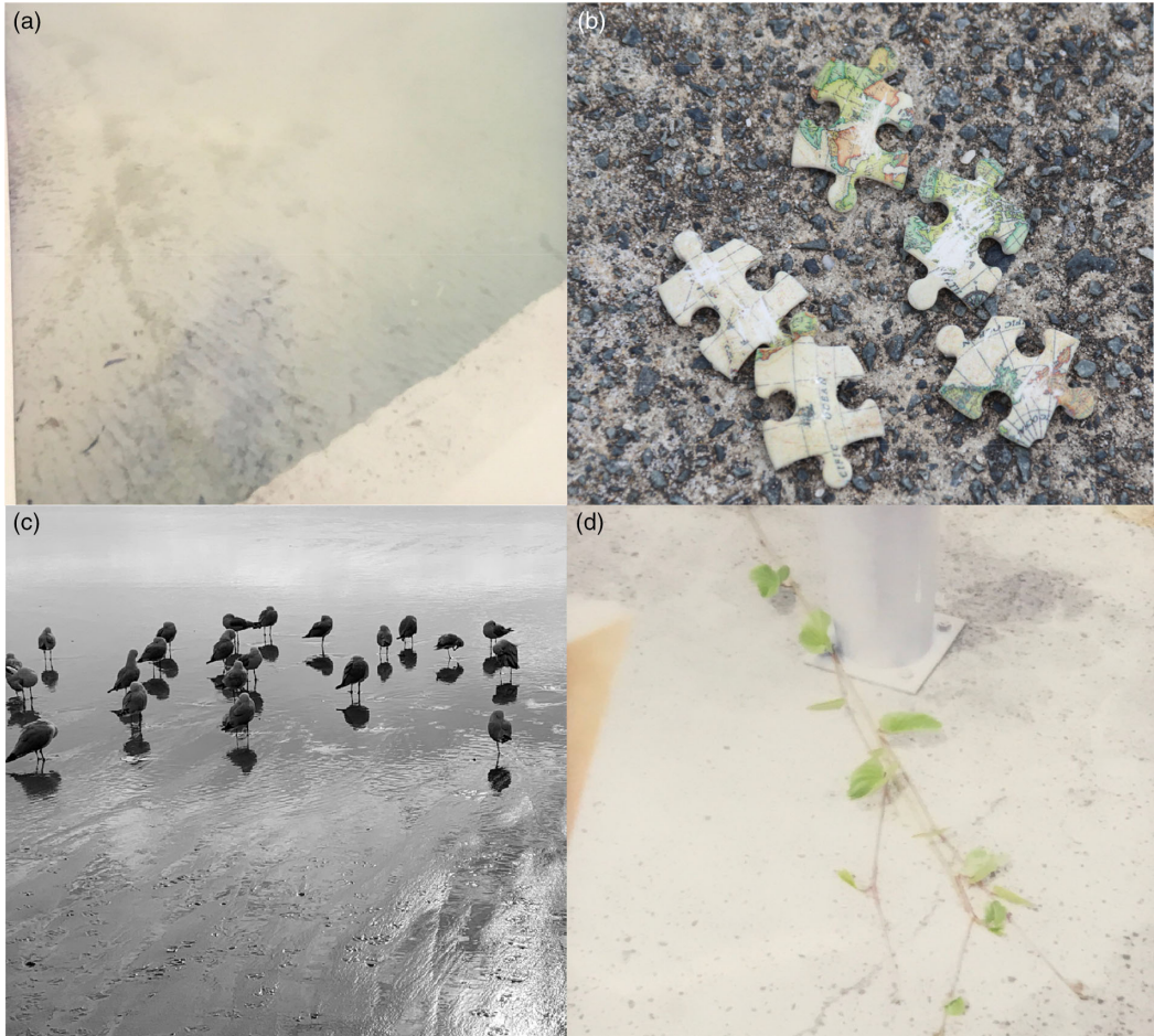
Figure 1. Series of photographs walking-with Deborah Bird Rose.

the extinction cascades, the extinction vortexes' . . . . Alongside some sparkling broken glass, pieces of puzzle catch our eyes, strewn across a concrete path, from a puzzle of the globe — fragmented, scattered, shattered — fragmenting ecosystems — cascading extinctions . . . . 'not only life and life's shimmer but many of its manifold potentials are eroding. (Rose, 2017, p. 55)