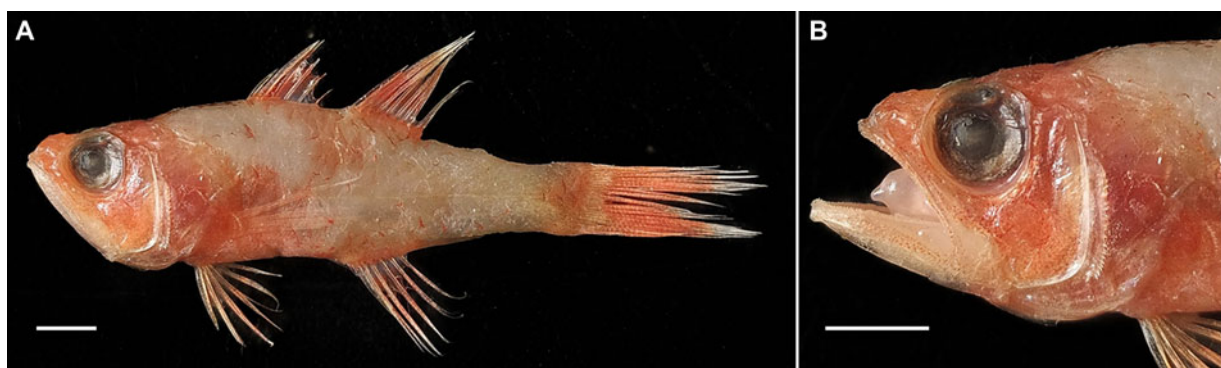
Figure 1. Apogon fugax (KU/COFS/MUS/010225) from northwestern India: (A) lateral view and (B) head. Scales (A-B) = 5 mm.

Distribution. Apogonichthyoides sialis is distributed in the Indo-West Pacific from Pakistan, India, Bangladesh (Habib et al. , 2021) and Myanmar, east to the Philippines, north to Japan (Figure 4); and has also been reported from the United Arab Emirates (Ludt et al. , 2020) as Apogonichthyoides cf. nigripinnis . In India this species has previously been reported from the southeastern coast (Gon, 2000); the southwestern coast at Cochin, Kerala (Manjebraayakath et al. , 2012) and the northeastern coast at Visakhapatnam (Silambarasan et al. , 2022); here it is recorded from Gujarat, northwestern coast of India (Figure 4).