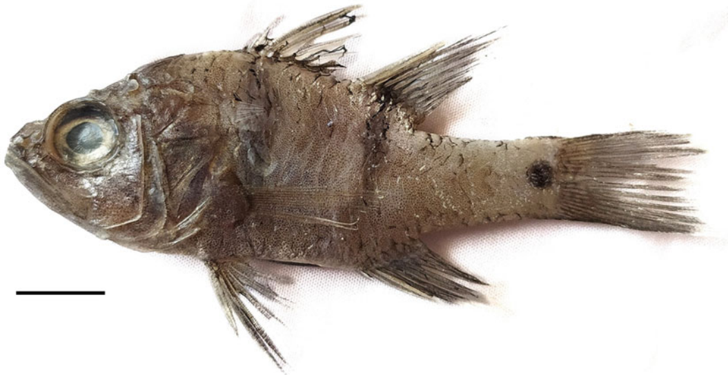
Figure 3. Lateral view of Apogonichthyoides sialis (KU/COFS/MUS/010229) from northwestern India. Scale = 10 mm.