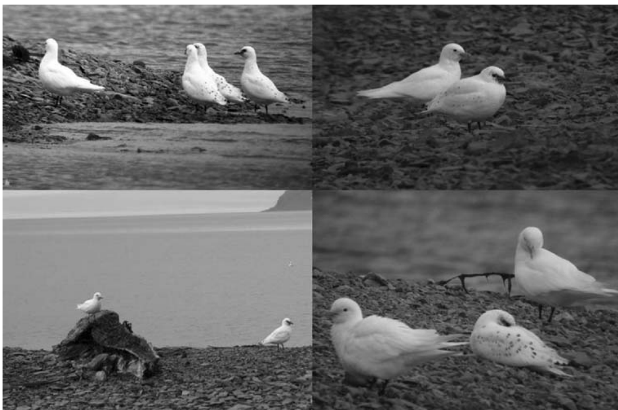
Fig. 1. Photographs of ivory gulls ( Pagophila eburnea ) taken by the authors in Resolute Bay, Nunavut, August 2005. In all photographs, both adult and juvenile birds are shown. Juveniles are identified by black on face, wings and tail.

1995). However an adult bird was observed to catch (and then lose) a small (approximately 10 cm) fish (species unknown) close to shore on 23 August 2005. Ivory gulls were observed in close association with glaucous gulls ( Larus hyperboreus ), black-legged kittiwakes ( Rissa tridactyla ) and northern fulmars ( Fulmarus glacialis ).