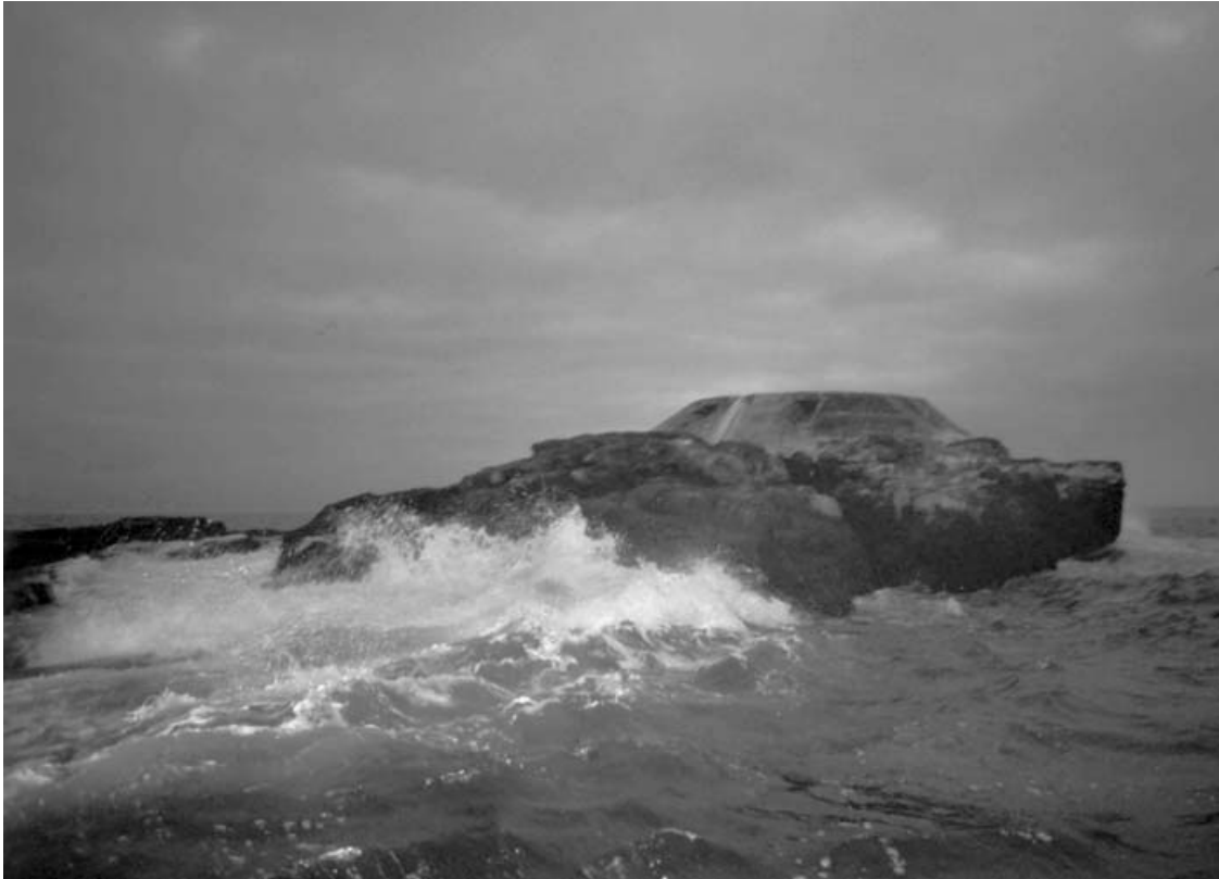
Fig. 1. Kolbeinsey. Picture taken on 24 May 2003 at 1:30 am.

coordinate fishing activities around that island (Denmark 1980).