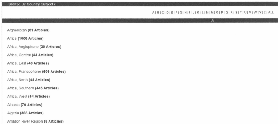
FIG. 4: IFLP COUNTRY SUBJECT LISTING

(See figure 4) Each index term has the number of associated articles in parentheses to give the researcher an idea of how large the results are for each Country Subject. When a Country Subject is selected, the indexed results are displayed with options to refine the selection along the sidebar. This section has taken advantage of the print version's Geographical Index and Periodicals Indexed by Country and merged them into a single indexing point, highlighting another advantage of the online database over the print version.