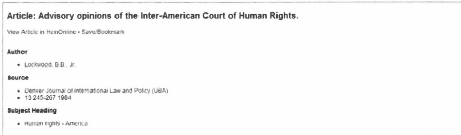
FIG. 7: IFLP INDEXED ARTICLE

that was mentioned on the HeinOnline Blog is the ability to add a link to Boalt Express for indexed entries in IFLP. 4 This provides the opportunity to get a copy of every article indexed in IFLP that is not available in HeinOnline. Boalt Express is described as “a non-profit fee based information delivery service operated as part of the UC Berkeley School of Law Library.” 5 This service charges fees for copying, research, and delivery services.