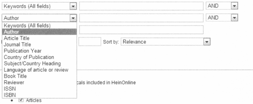
FIG. 2: IFLP FIELD SEARCH OPTIONS

One notable feature of the search functions, mentioned in the search tips, is that searching using non-English languages does not require the use of diacritical marks (accent, dot, hyphen, tilde, umlaut, etc.). IFLP contains journals published in many foreign languages, which would make searching difficult in a non-tailored database. Without the need for diacritical marks when searching, researchers will find it easier to locate articles and publications through the IFLP database than most other online offerings.