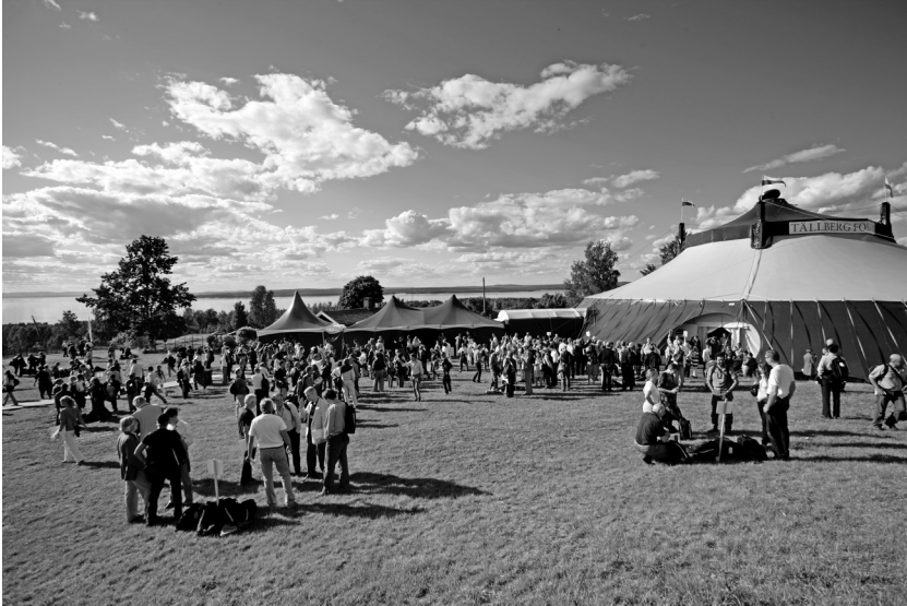
FIGURE 7.3 Tällberg, a small village in the province of Dalecarlia, Sweden, was the place of several years of Midsummer conferences where Earth System scientists and other scholars engaged and networked with politicians, activists, artists, businessmen, trade unions, sponsors, media, royalty, and members of the general public. Workshops took place in nineteenth-century cottages, talks were held, and music was played for hundreds of people in big tents. Collective nature walks took place in the surrounding landscape in an old Swedish out of doors tradition.

exchange under the banner “How on Earth can we live together?.” In a village of small wooden houses, Tällberg Forum sessions took place inside large circus-style tents that could be seen as symbolizing the “big tent” approach to global problems that the Tällberg Foundation had fostered for forty years.