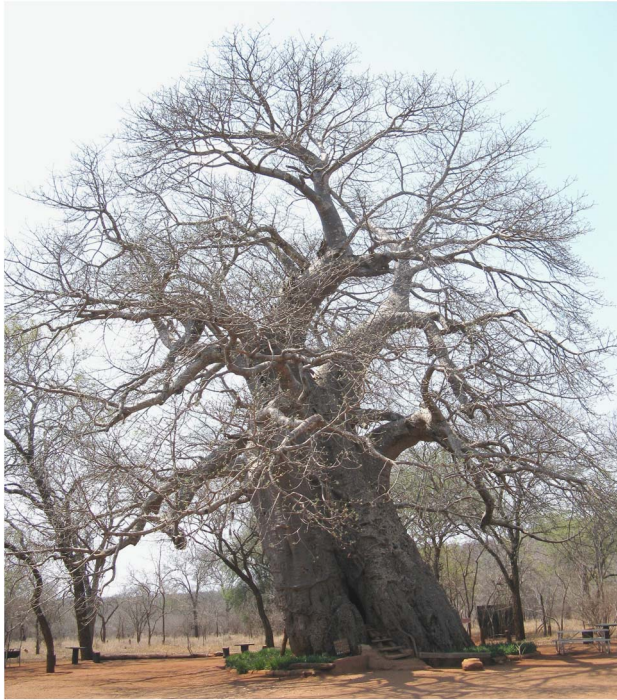
Figure 4 The leaning Leydsdorp baobab has a closed ring-shaped structure, defined by three perfectly fused stems, that close a false cavity; the cavity was used in the past as a bar. The old tree rises solitary in Mpumanalanga, South Africa.