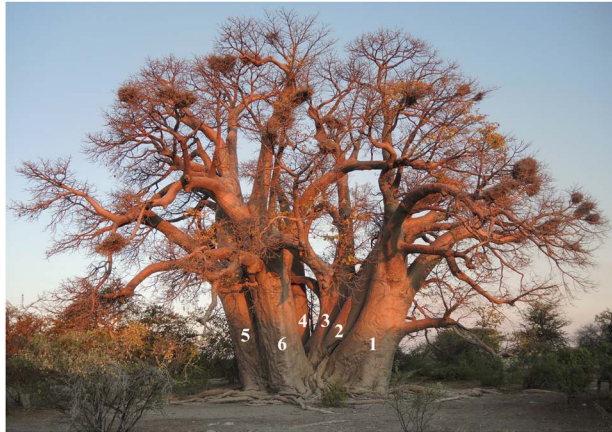
Figure 3 The Chapman baobab, the historic landmark tree of the Makgadikgadi salt pans of Botswana, is a typical example for the open ring-shaped structure. Its six main stems, which are numbered in the picture, were fused only at the base. In 2016, the six stems toppled and died.

The historic Leydsdorp baobab (Gravelotte, Mpumanalanga, South Africa; 23°57.427'S, 30°34.509'E, 565 m, 357 mm) has a height of 21.0 m, a circumference at breast height of 19.20 m, and a wood volume of 230 m 3 (Pakenham 2004). It possesses a closed ring-shaped structure with a false cavity inside. The ring consists of three perfectly fused stems that close the false cavity (Figure 4).