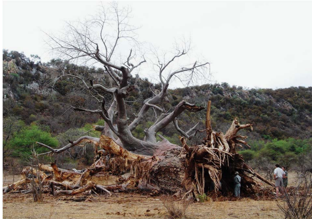
Figure 1 General view of the Pafuri Outpost baobab, which fell over and died in 2008, in the Pafuri section of the Kruger National Park, South Africa.