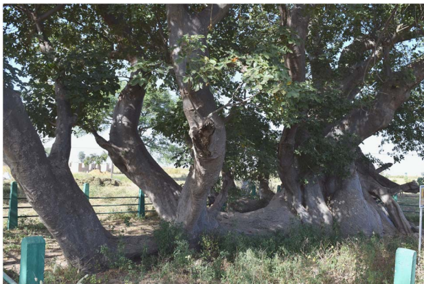
Figure 5 The historic Gouye Ndiouly from Kahone, the old capital of the Saloum Kingdom, as it looks today. One can notice the only surviving old stem, which lies horizontally, and the new shoots that emerged from the remains of the fallen stems.