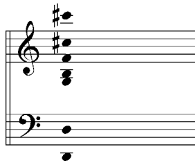
Example 6b) Porgy , chord in Act 1, R83 + 2; Act 2, R169; Act 2, R255 + 2

Example 6. From Porgy and Bess , by George Gershwin, DuBose and Dorothy Heyward, and Ira Gershwin. © 1935 (Renewed 1962) George Gershwin Music, Ira Gershwin Music, and Dubose & Dorothy Heyward Memorial Fund Publishing.