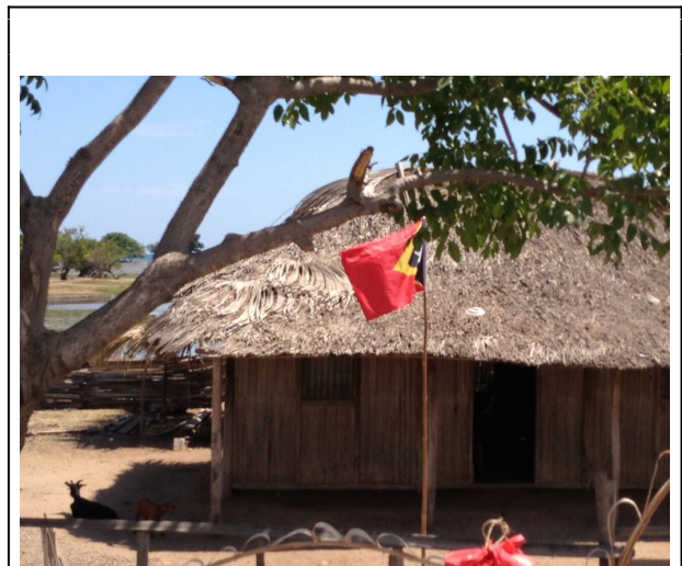
House and flag on the road from Dili to Liquiça, 2015.