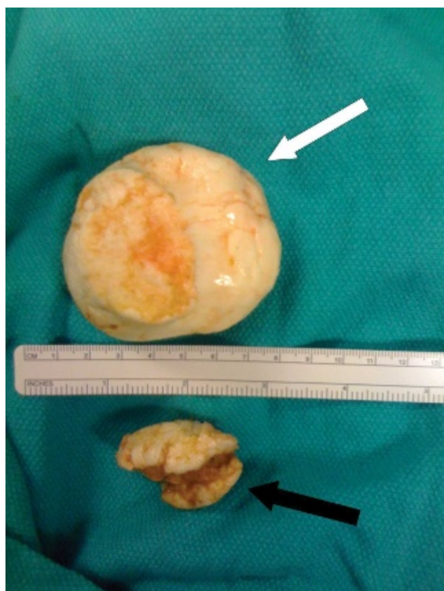
Figure 3. Spray foam insulation foreign bodies removed from the rectum in the emergency department ( white arrow = proximal foreign body [note the smooth appearance of the exterior once cured]; black arrow = distal foreign body from the region of the anal sphincter).

Spray foam insulation is a polyurethane compound primarily used in cavity sealing. It is composed of