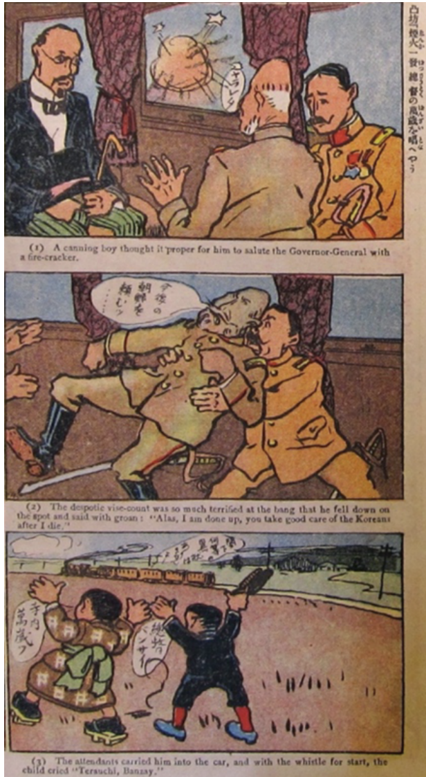
Figure 3: The Osaka Puck comic strip titled “Let’s cheer the Governor-General with a firecracker salute” (Enka ippatsu sôtoku no banzai o tonaeyô, February 15, 1911) portrays the moment that a paranoid Terauchi Masatake experiences a colonial panic attack.

After March First, the imperial insecurities of the sawagi crossed borders, moving from colonized masses to ethnic Japanese officials and settlers, and ultimately to the metropolitan public. Such migrations were mediated through