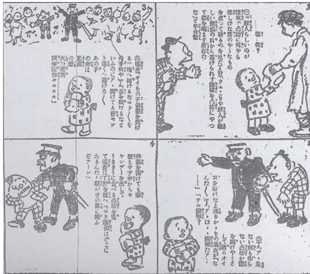
Figure 4: The cartoon “Bomb?” (Bakudan? Jiji Shinpō, October 12, 1920), captures signs of mass panic from the colony migrating to the metropole.

A significant number of images and stories like this one were circulated in the years after the March First Uprising unsettled Korea’s place within imperial Japan. The point is that panic, paranoia, insurrection, and terror associated with the colony and the colonized were very much in the air and in the culture prior to the unforeseen seismic disaster, stimulating the anxious imagination of an empire on the verge of breakdown. The parlance associated with post-disaster unrest and massacres— sawagi , ryūgen higo , bakudan —that seemed to spring from nowhere in 1923, was already firmly established in the discourse and available for repurposing. The same vocabularies and tropes animate and structure both the fantastic stories about Korean sedition that precipitated violent panic (i.e., the rumors), as well as the stories that subsequently reconstructed the experience of the sawagi in testimony, commentary and