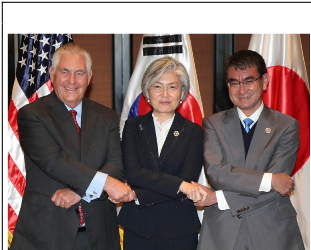
Foreign Minister Kang Kyung-wha, center, holds hands together with U.S. Secretary of State Rex Tillerson, left, and Japanese Foreign Minister Taro Kono during their joint talks on the sidelines of the ASEAN Regional Forum in Manila, the Philippines, Monday.

Strange sentiment, one might argue, for a government propelled into power by opposition to Park Geun-hye, who in deference to the US-South Korea relationship agreed to THAAD, and to a desire for change.