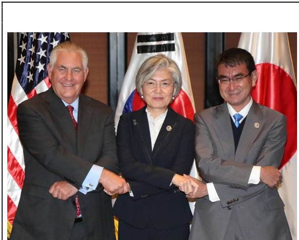
Foreign Minister Kang Kyung-wha, center, holds hands together with U.S. Secretary of State Rex Tillerson, left, and Japanese Foreign Minister Taro Kono during their joint talks on the sidelines of the ASEAN Regional Forum in Manila, the Philippines, Monday.

Strange sentiment, one might argue, for a government propelled into power by opposition to Park Geun-hye, who in deference to the US-South Korea relationship agreed to THAAD, and to a desire for change.