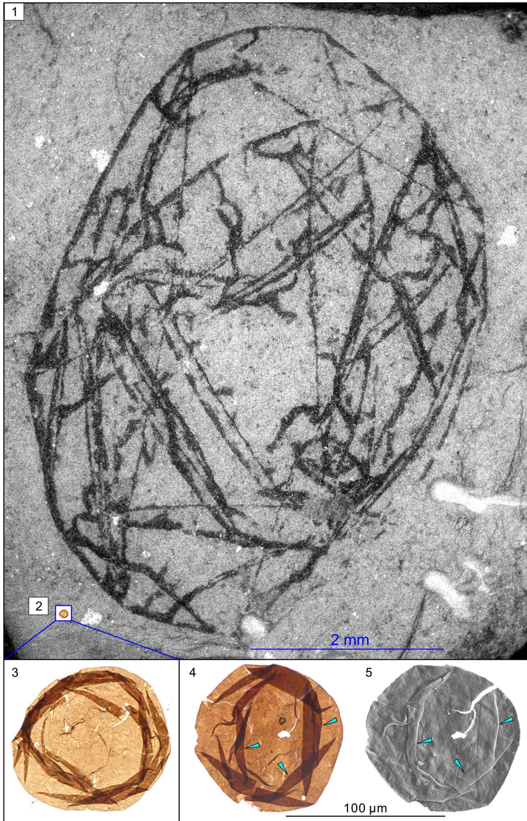
Figure 1. Size and morphological differences between Cambrowania (1) and Leiosphaeridia (2–5). (1) Backscattered electron scanning electron microscopic photograph of Cambrowania from the early Cambrian Hetang Formation, preserved on bedding surface; HT-T8-9V-25, VPIGM-4729. (2–5) Acid-extracted specimens of Leiosphaeridia from the Tonian Gouhou Formation; (3) is a magnification of (2), showing concentric folds; 11-GH-10-SEM-3-19, VPIGM-4795; (4, 5) light microscopic and SEM photographs, respectively, of the same specimen, showing spindle-like lanceolate folds (arrowheads); 11-GH-10-SEM-5-17, VPIGM-4796; (1 and 2) are shown to the same scale (the 2 mm scale) to emphasize the size difference between typical Cambrowania and Leiosphaeridia specimens. The 100 µm scale applies to (3–5).