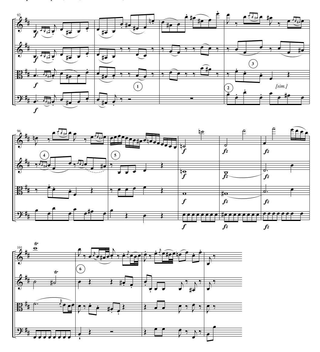
Example 8.2 Op. 64, no. 2, first movement, mm. 92-104

want to join the staccato bandwagon. At (4) the second violin's independence turns out to have been prescient, as its three-note figure, fitted with a turn, converses directly and relevantly with the first violin. The second has thus transformed itself from mere sidekick to the supporters into the co-leader of the conversation. However that moment in the sun is (as always) shortlived, as the first violin and cello together push the argument off its dominant pedal and towards an extended cadence in which the first violin takes on a kind of diva role. The cello here keeps the rhythm going, lending life to the first violin's long notes, and the two inner parts provide "mere" harmonic