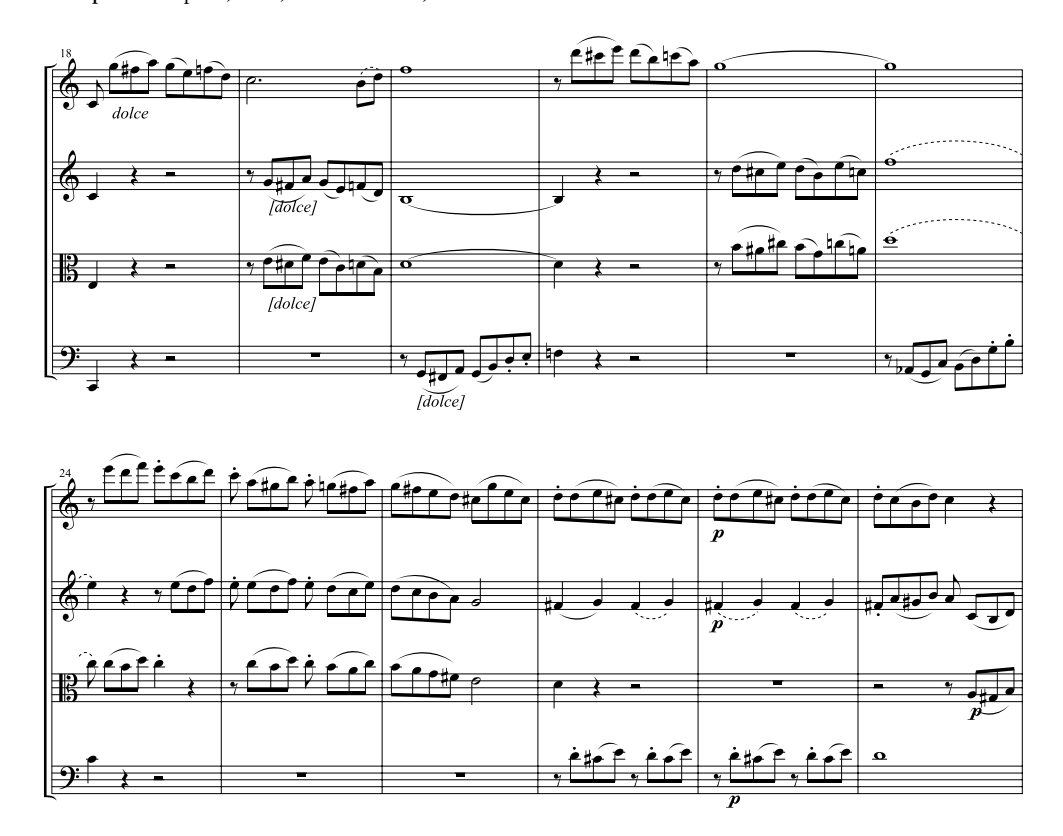
Example 8.1c Op. 74, no. 1, first movement, mm. 49-54