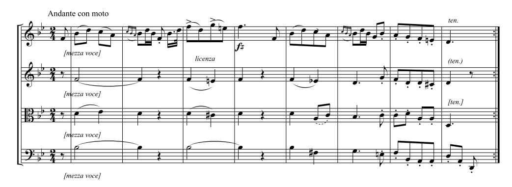
Example 8.3 Op. 71, no. 3, second movement, mm. 1-8

both of this movement in particular and of finales in general. Witticisms that play on the listeners' expectations can also involve structural stereotypes: the first movements of the quartets (especially those before Op. 50) are full of false or otherwise ambiguous or elided moments of recapitulation. And in the grazioso binary theme of the slow movement in Op. 71 no. 3, the first strain, which "should" go to the dominant, F major – and even does, briefly, at the beginning of m. 7, gets diverted to d minor – a very peculiar ending for a theme that started out so innocuously (see Ex. 8.3). Because jokes such as these rely on the listeners' (and players') structural and generic expectations for their appreciation; because, in other words, the recipients of the works need to contribute something quite specific in order "properly" to receive them, many of the witticisms in these quartets can be said to contribute to their overall ethic of conversation, with the interchange here occurring between the composer on the one side and all qualified players and listeners on the other. The subtle and technical nature of many of these witticisms also demarcates an "inner circle" of aficionados perhaps analogous to the ideally exclusive circles in which "true" conversation took place.