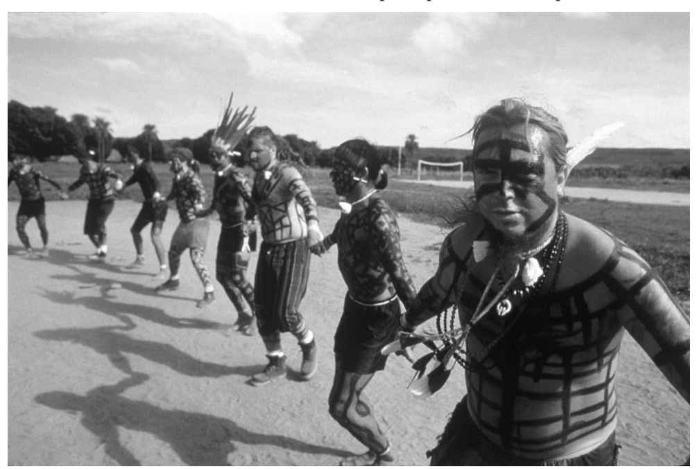
Figure 5. Sepultura recording with Xavanta tribe, Pimentel Barbosa, Brazil, 1996

Like all such projects, Roots has its problems. Whilst the Xavante appear to have been treated with respect and receive royalties, it is unclear how they understood the project and what they will get out of it. The Xavante had little say on how the piece was set within the album (although 'Itsari' was not overdubbed at all). Neither can Sepultura ensure that those who purchase their albums will not exoticise the Brazilianness in the project. Nonetheless, Sepultura did approach Roots in a spirit of discovery that avoids many of the pitfalls that other artists have fallen into in such projects. The collaboration was not intended simply to add exotic 'colour' to their music, but was a sincere (if perhaps naïve) attempt to collaborate