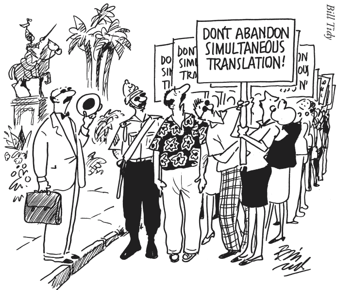
“You’re right – They are all in English!”

Simultaneous translation, to use a hideous current phrase, is not rocket science. This annoying expression is a media way of implying that something desirable is being delivered with dilatory circumspection, usually by an academic. Werner von Braun (1912–77), who knew a thing or two about rocket science, is credited with another saying: “Basic research is what I’m doing when I don’t know what I’m doing”. I wonder what the new breed of academic manager would make of that, and whether any rockets would emerge from our more highly prescriptive culture of research planning, monitoring and control. In a humanist science like archaeology, in which the capacity to surprise should never be exhausted, it would be a shame if efficiency were to become the bridle of curiosity.