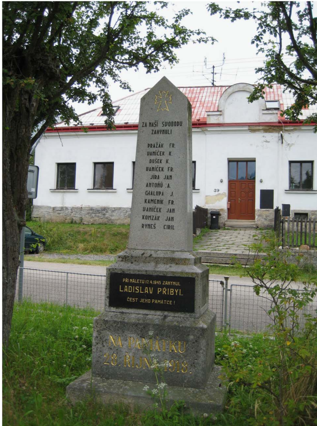
Figure 1. The Bolíkov War Memorial

Sumrakov and Bolíkov, which today lie on the verge of natural reserve called 'Czech Canada', supply a disproportionate number of Green Guard fighters in his book: