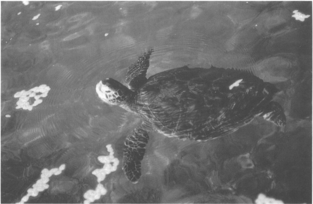
Green turtle, Indonesia.

Smith (1972) commented that many plastics contain considerable quantities of PCBs as plasticizers. These can be released from plastic during its breakdown and Ryan et al. (1988) established that levels of PCBs in sea birds were positively correlated with the amount of ingested plastics. The possibility of PCBs accumulating in sea turtles as a result of plastic ingestion does not appear to have been investigated.