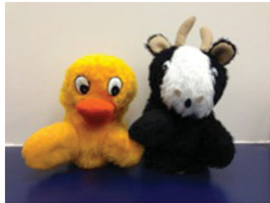
Figure 1. (Colour online) Duck and cow puppets used in DI task.

For the generalization task, two hand puppets (a black-and-white cow and a yellow duck with an orange bill) 30 cm in height and made out of soft acrylic fur were used. A removable felt mitten (8 cm x 9 cm) was placed