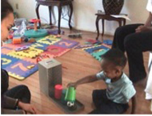
Figure 2. (Colour online) Eighteen-month-old completing a trial on the Hide the Pots WM task.

MCDI Words and Sentences Short Form is appropriate for infants 16- to 30-months of age and contains a 100-word checklist. Of the 100 words, 52% of the items were nouns, 18% were verbs, 15% were adjectives and adverbs, and 15% were pronouns, prepositions, and other parts of speech (Fenson, Pethick, Renda, Cox, Dale & Reznick, 2000). A short-form of the MCDI was not available for infants growing up in Spain (the available Spanish form is used for Spanish-speaking countries outside of Spain), therefore modifications were made in order to collect the most accurate vocabulary totals. For the bilingual infants in Washington DC, the caregiver was asked to fill out the same form for both languages, marking the words the infant could produce and in which language (English, Spanish, or both). For the infants in Barcelona, a native Spanish/Catalan bilingual who was also fluent in English translated the MCDI. Again, parents were asked to mark the words the infant could produce in which language (Spanish, Catalan, or both).