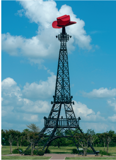
Figure 1 Eiffel Tower in Paris, Texas, US.