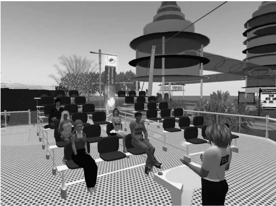
Fig. 1. The lecture theater in USQ Island