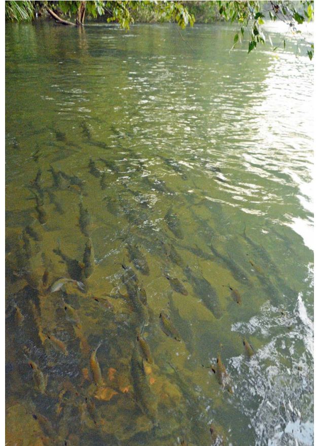
PLATE 3 The informal Sitanadi fish sanctuary in Karnataka, India.

Threats originating within the social–ecological system are linked to the various subsystems and the interactions between them (Jupiter et al., 2017). Often the efficacy of a social–ecological system centred on common-pool resource management relies on the ability of participatory mechanisms to align individual interests with those of the group