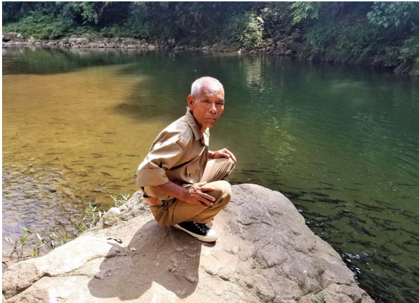
PLATE 2 Protector of the Wachi Wari fish sanctuary, a community-based conservation reserve in West Garo hills, Meghalaya, India.

realized is driven further by the policies and institutions governing these sanctuaries (Kalaba, 2014), which vary across sanctuary types.