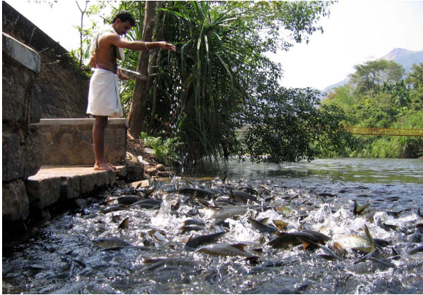
PLATE 1 The Shishileshwara temple fish sanctuary on the Netravathi River in Karnataka, India.