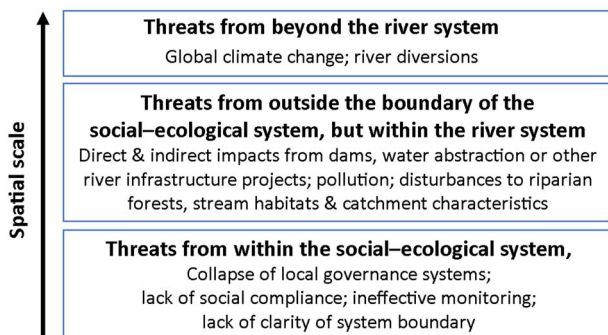
Fig. 2 Threats to community-based fish sanctuaries in India across spatial scales.

Threats at an intermediate scale, from outside the boundary of the social–ecological system but within the river system, are also prevalent. As most fish sanctuaries are not well documented and receive little to no formal protection, they are often ignored in environmental impact assessments and development planning. Consequently, many have been lost or are under threat from hydropower dams, water diversion projects, development