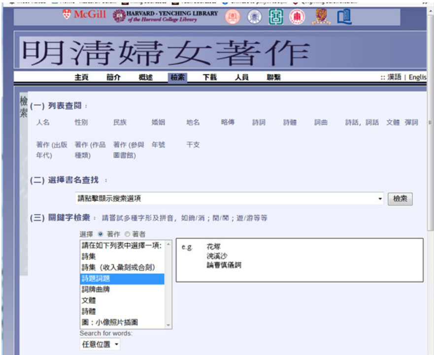
Figure 1. Search page, http://digital.library.mcgill.ca/mingqing/search/index_ch.php

period (1911–1949). There are also some hand-copied manuscripts ( chaoben 抄本 / 鈔本). 2