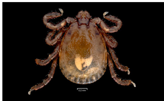
Adult male Ryukyu rabbit tick Haemaphysalis pentalagi .

An ex situ insurance population of H. pentalagi has been established at Hokkaido University from individuals collected on Amamioshima. This population has successfully reproduced in captivity and had completed one full life cycle as of May 2024, with the second captive-bred generation now maturing. A husbandry manual for this