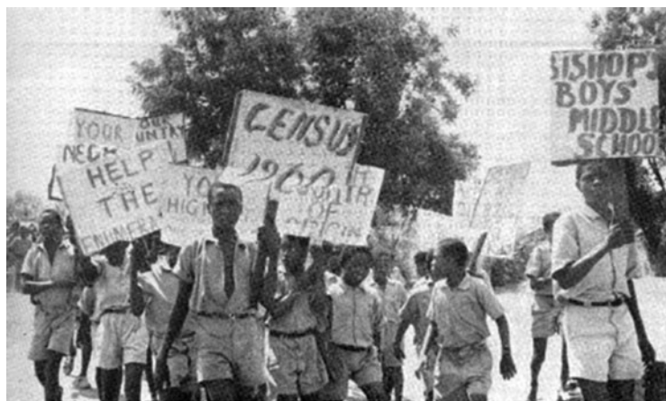
FIGURE 1. School children show their support for the census. Gil and de Graft-Johnson, Census , vol. V, n.p.

many crucial differences. The Pioneers drew inspiration from their Soviet counterpart, and in the Ghanaian imagination they evoked dark tales of brainwashing and coercion. People saw them as spies who reported to the local authorities expressions of dissent against the regime, even those uttered by their parents. 88 Furthermore, the content and language of the census campaign's educational materials was quite unlike the "Nkrumaist gospel" imposed on the Pioneers, which emphasized new forms of revolutionary citizenship, and loyalty to the Convention People's Party and to Nkrumah as the nation's messiah. 89 Despite these differences, when we look at the campaign and the movement in the same historical frame, they appear as complementary elements of an emerging order in which children were employed to project, mediate, and disseminate new, official representations of the postcolonial state at grassroots levels. It would be overreaching to suggest that the census campaign directly shaped the evolution of the Young Pioneers, but it is ironic that some of the