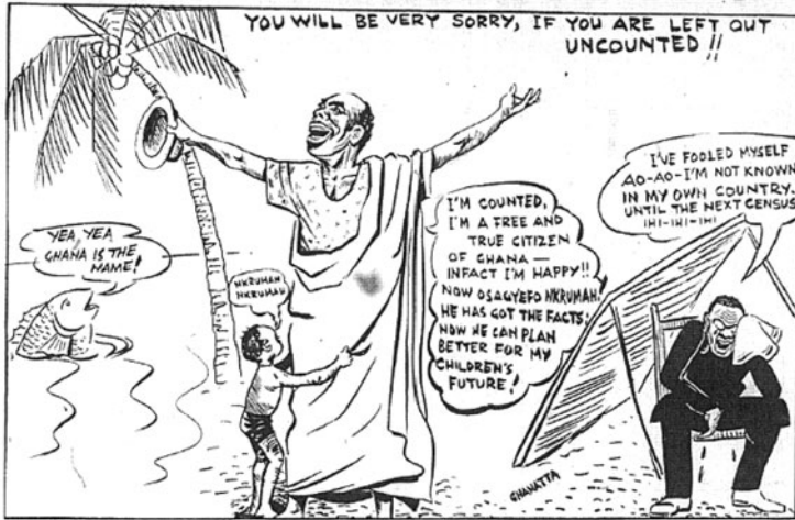
FIGURE 2. Ghanatta, “You will be very sorry, if you are left uncouned!!!” Evening News , 18 Mar. 1960.

football matches, bonfires, tolling of church bells, mass religious services, and beating of drums. The 20th March celebrations served both symbolic and practical purposes. Since the 1960 count was a de facto census—counting the people actually present in the country during the enumeration rather than the usual residents (a de jure census)—the festivities could “impress on the whole population this specific date which was used as a reference date for several census items” and, by enumerating each individual “only at the place of stay of Census night” reduce the potential for ambiguous answers, confusion, and double counting. 112 On the other hand, by inscribing the census into the nation’s memory and subjugating the national population “to a social time fixed by the government,” 113 the festivities articulated the vision of an “imagined community” in which spatial differences lost meaning, and in which the notion of the census as a secular, rationalistic, and technocratic exercise was complemented with narratives of “traditional” culture (see figure 3).