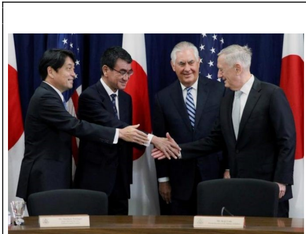
Japan’s Defense Minister Itsunori Onodera and Foreign Minister Taro Kono shake hands with U.S. Secretary of State Rex Tillerson and Defense Secretary James Mattis before sitting down for U.S.-Japan security talks.