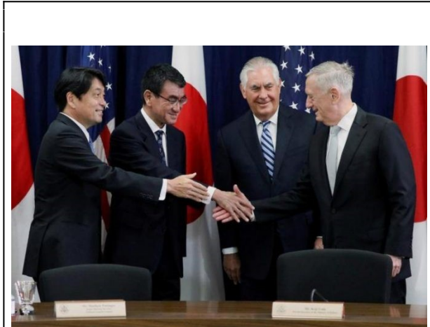
Japan’s Defense Minister Itsunori Onodera and Foreign Minister Taro Kono shake hands with U.S. Secretary of State Rex Tillerson and Defense Secretary James Mattis before sitting down for U.S.-Japan security talks.