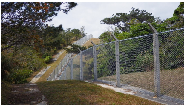
High fence surrounding storage area (2014 photograph)

Meanwhile, after-effects of the base persist. Three Army veterans of the 137th from the