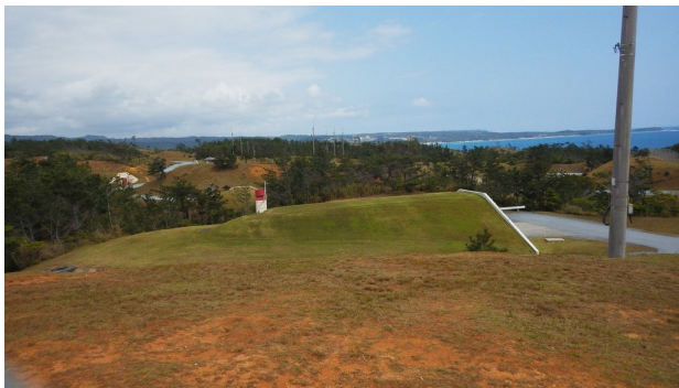
Storage area with fortified underground igloos that contained nuclear weapons before reversion (2014 photograph)

government paid for the removal of nuclear weapons from Okinawa are the first and only time the U.S. government has acknowledged their presence. 4 Since they were removed, the Marines have used the base to store conventional (non-nuclear) ammunition. However, the nuclear weapons storage area remains intact to this day with close-cropped grass and sod-covered concrete storage igloos with steel doors.