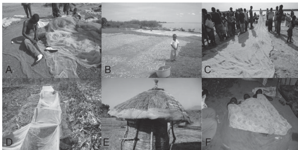
Fig. 1. Examples of alternative ITN uses. (A) Sewing bednets to create larger nets. (B) Drying fish. (C) Fishing. (D) Crop protection. (E) Granary protection. (F) Sleeping mat.