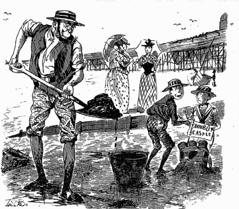
HOOLIGAN AT SOUTHEND-ON-MUD.

Mrs. Hooligan: "Yis, marm, we have jist come down fer a we-k and our hilths. Me ould man is showing the kids how ter make castles in the beautiful sand."